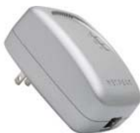
Netgear XE102 7

By inserting a network cable into a device like Netgear's XE102 7 and then plugging it into an electrical outlet, an individual can turn a building's electrical wiring into a 56-bit DES encrypted network that cannot be sniffed or detected like wireless. By using a second EoP device, an intruder can be anywhere in a building and casually search for and steal data without revealing his real physical location. If an EoP device is discovered, it will most likely be overlooked as a power supply or some sort of surge protector.