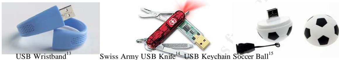
USB Wristband 13

The capacity of USB drives today has increased while their size has decreased, thereby making USB drives one of the best ways to transfer data, both into and out of a system. Thanks to the variety of products that USB drives have been integrated into, it is very easy to sneak them into the work place.